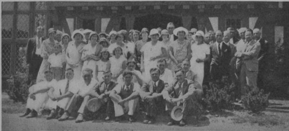
Here are some of the Michigan greenkeepers and their families assembled at Michigan Aggie for a recent two-day session.