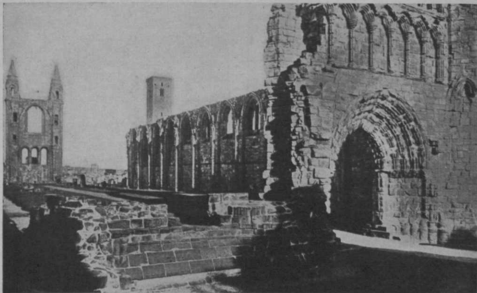
The burying ground of the Morrisses, where American golfers recently paid tribute, lies behind the ruined Abbey of St. Rule.