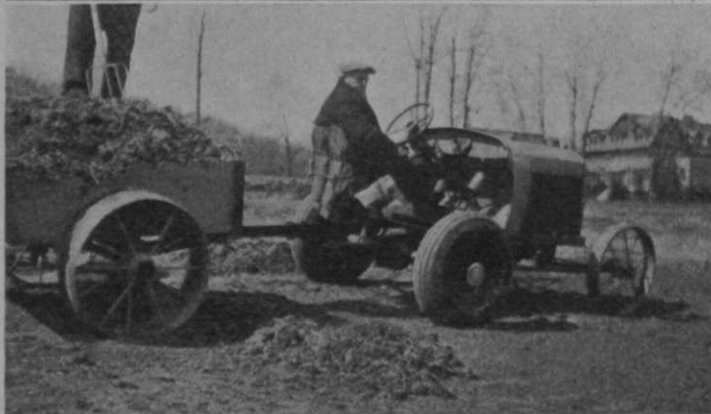
Top—McCormick-Deering tractor on Airwheel tires at the Colonial Country Club, New Orleans. Bottom—Worthington Mower tractor on 9.00-13 Airwheels at the Baltusrol Golf Club, Short Hills, N. J.