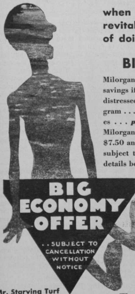
Mr. Starving Turf

Milorganite's Big Economy Plan offers tremendous savings if you act at once . . . permits even the most distressed clubs to continue a sound improvement program . . . creates new Leaders out of Secondary Courses . . . provides generous applications of high analysis Milorganite at the astonishing, low cost of $5.00 to $7.50 an acre. Offer limited to car load users only and subject to cancellation without notice. Get complete details before this unusual offer is withdrawn.