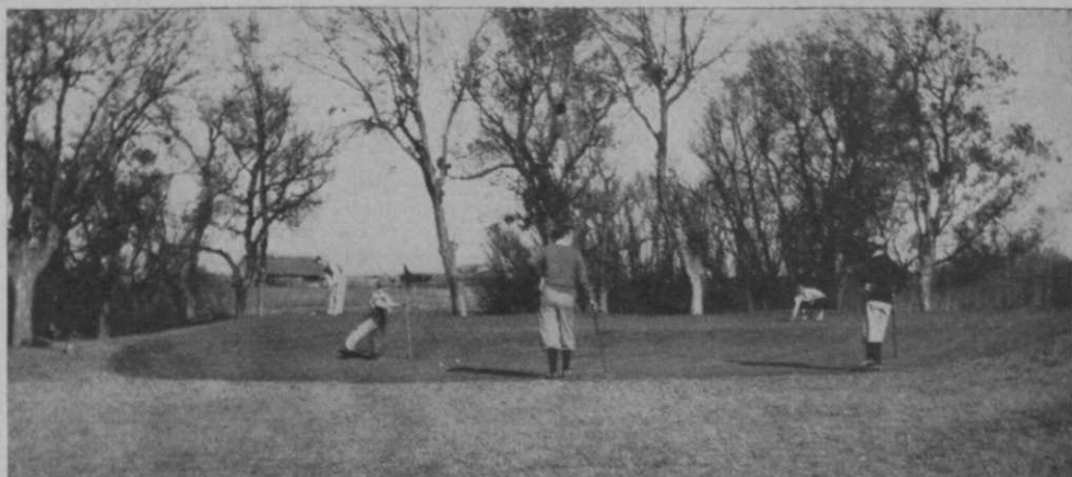
Contoured greens where you'd expect sand adds to Temple course's interest

4,500 to 5,000 sq. ft. Since coming here in 1923 I have rebuilt nearly all the greens and lengthened all holes with the help of two colored men in the summer and one in winter. At present I am building grass tees to replace the clay ones formerly used and am installing a hoseless sprinkling system, to keep them in shape, doing all the plumbing work myself. I have four tees completed with 3 to 6 sprinklers, each throwing a 20 ft. spray, and in the near future I expect to have all nine finished.