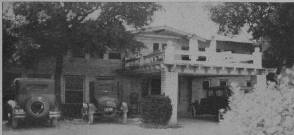
Pleasant landscaping makes Temple clubhouse attractive