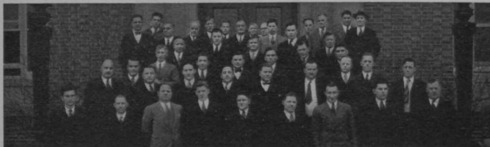
Shock-troops in battling Wisconsin greens problems meet at Madison