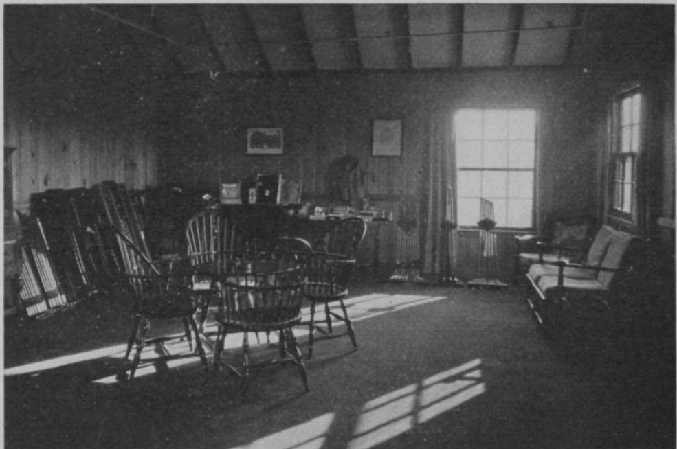
Sunset Ridge's pro lounge provides atmosphere to encourage buying instead of making it necessary to heat 'em up and sell 'em