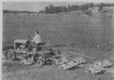
For transporting, the mowers are swung around behind, and the total width is less than that of a three-unit outfit.