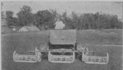
New Master five-unit outfit. Two extra motors can be added instantly, converting it into a seven.

A highly powerful light-weight mowing outfit that will handle fairway mowing in approximately half the time required by the old types.