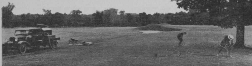
Feeding a tree by the perforation method. The workmen, with compressed-air tools, are boring a series of holes in the ground, out to the approximate limits of the tree's root system, prior to sub-surface fertilizing.

This article, a continuation of one by Mr. Jacobs in our December number, tells what kinds of fertilizers to use and how they should be applied to give best results.