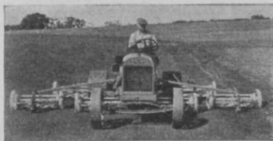
Note the arrangement of the two front mowers, which cut the grass before it is matted down by the drive wheels.