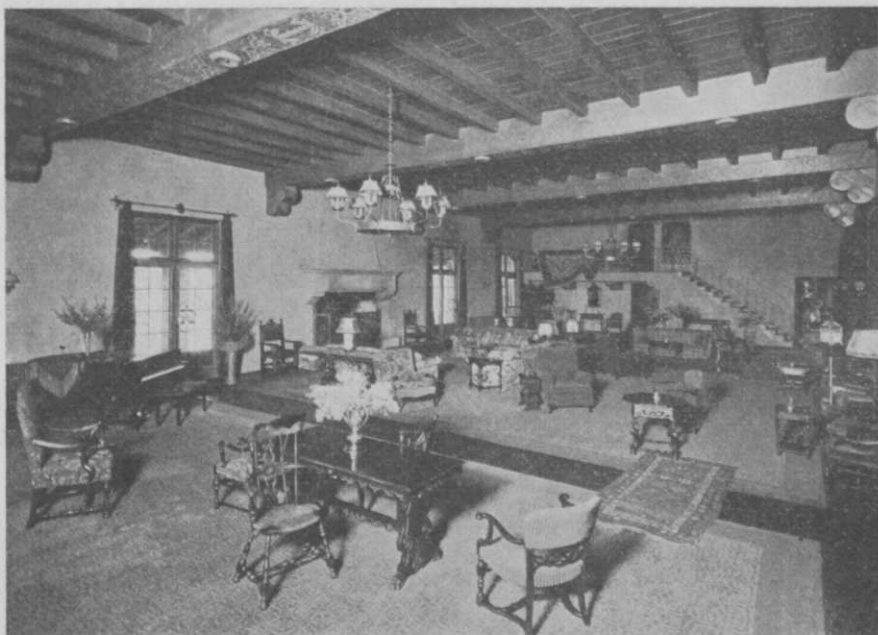
Brentwood's lounge greets member and guest with hospitable atmosphere.

the market can supply. I pay the highest prices to secure the finest and my system of inspection of merchandise that enters the kitchen forestalls any inferior quality getting past the kitchen door. Back goes any item not up to standard. Everything must be 100%. Something almost as good will not do at Brentwood.