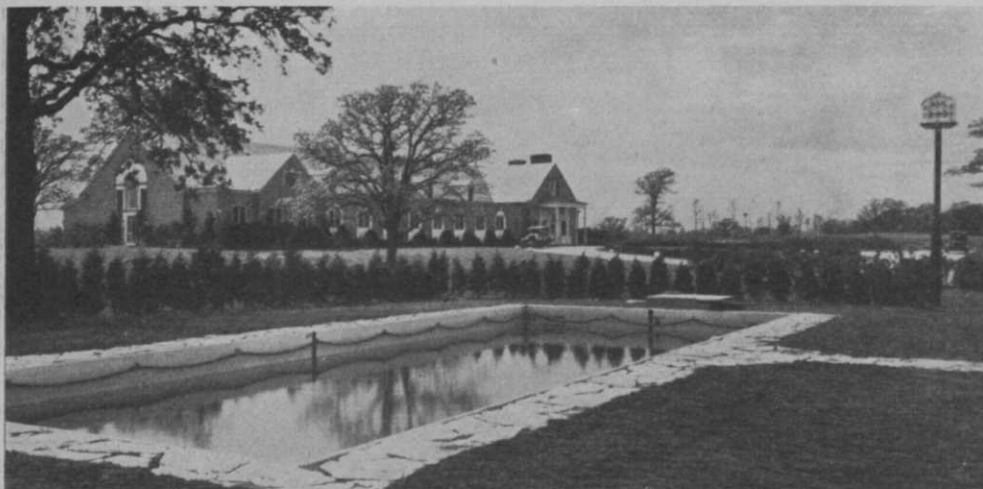
Knollwood C. C. (Chicago district) has attracted a colony of purple martins, voracious mosquito-feeders, to the bird house on the right and thus minimizes annoyance from insect pests around its outdoor pool.