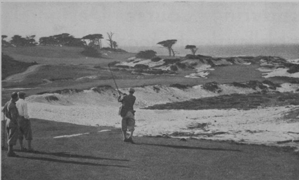
The thrill of playing a well laid-out golf hole, such as this 13th at Cypress Point, a MacKenzie course, is never destroyed by "improvements" in clubs or ball.

mystery, but the fact of the matter is that St. Andrews differs from others in that it has always been deemed a sacrilege to interfere with its natural beauties, and it has been left almost untouched for centuries. No greenkeeper has ever dared to shave down its natural undulations. Most of the bunkers have been left where nature placed them, and others have originated from the winds and the rains enlarging divot marks left by the players, and some of them possibly by the greenkeepers converting those hollows where most players congregated, into bunkers, owing to the difficulty of keeping them free from divot marks. The bunkers at St. Andrews are thus placed in positions where players are most likely to go—in fact, in the precise positions which the ordinary green-committee would suggest should be filled up. This is a significant fact, and tends to show that many of our existing ideas in regard to hazards have been erroneous.