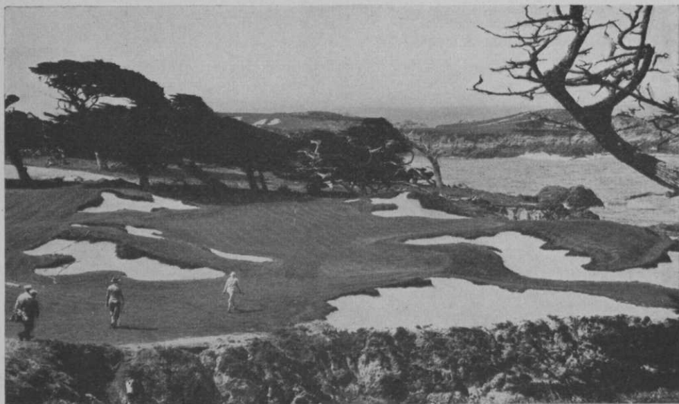
Real architecture consists in taking full advantage of all natural features, modifying them only to the extent necessary to simplify maintenance and expedite play. Fifteenth green at Cypress Point.

gard playing requirements of some others.