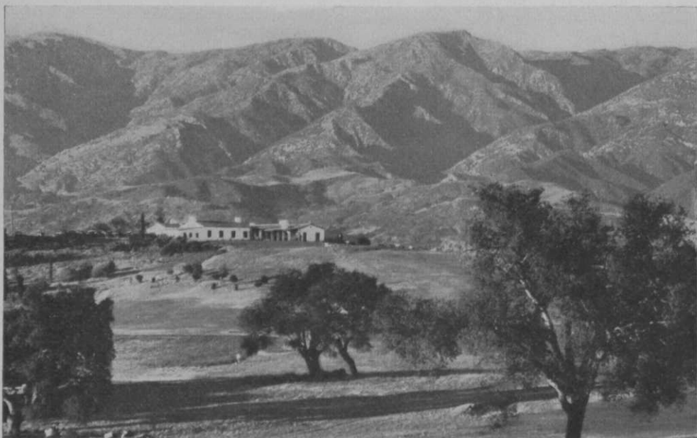
The setting of La Cumbre G. & C. C. at Santa Barbara, Calif., gives an idea of the geological conditions that make specialization of greens force advisable.

"Some years back I had the misfortune to suffer a yearly infestation of Bermuda grass in my greens. Although I kept up a regular weeding schedule I did not seem to be making any progress until I discovered that the men, when my back was