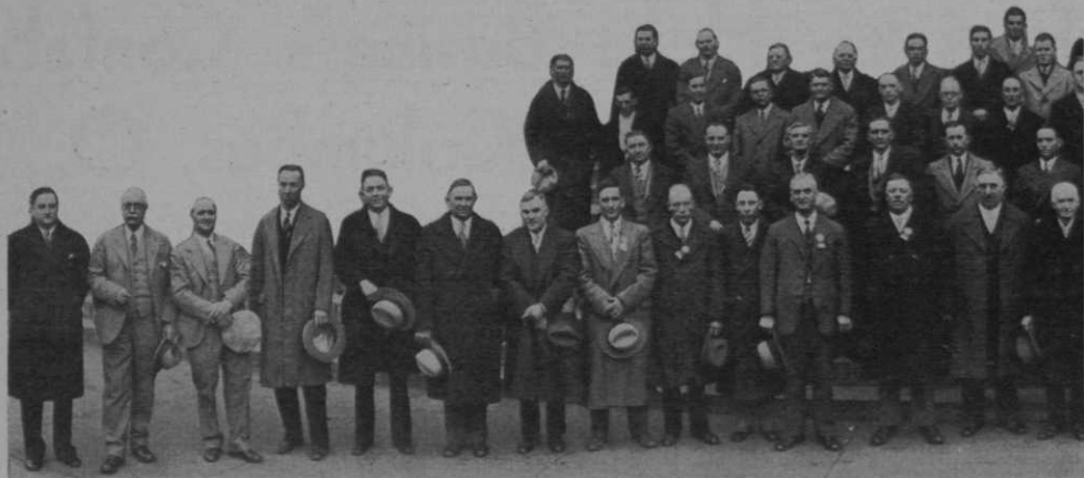
This photograph of the Columbus show's delegates and speakers includes only a portion