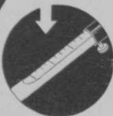
A close-up view of the Shaler measuring scale. The device enables the selection of perfectly fitted clubs.

THE SHALER CO., 1507 Fourth St., Waupun, Wis. Factories: Milwaukee and Waupun, Wis.