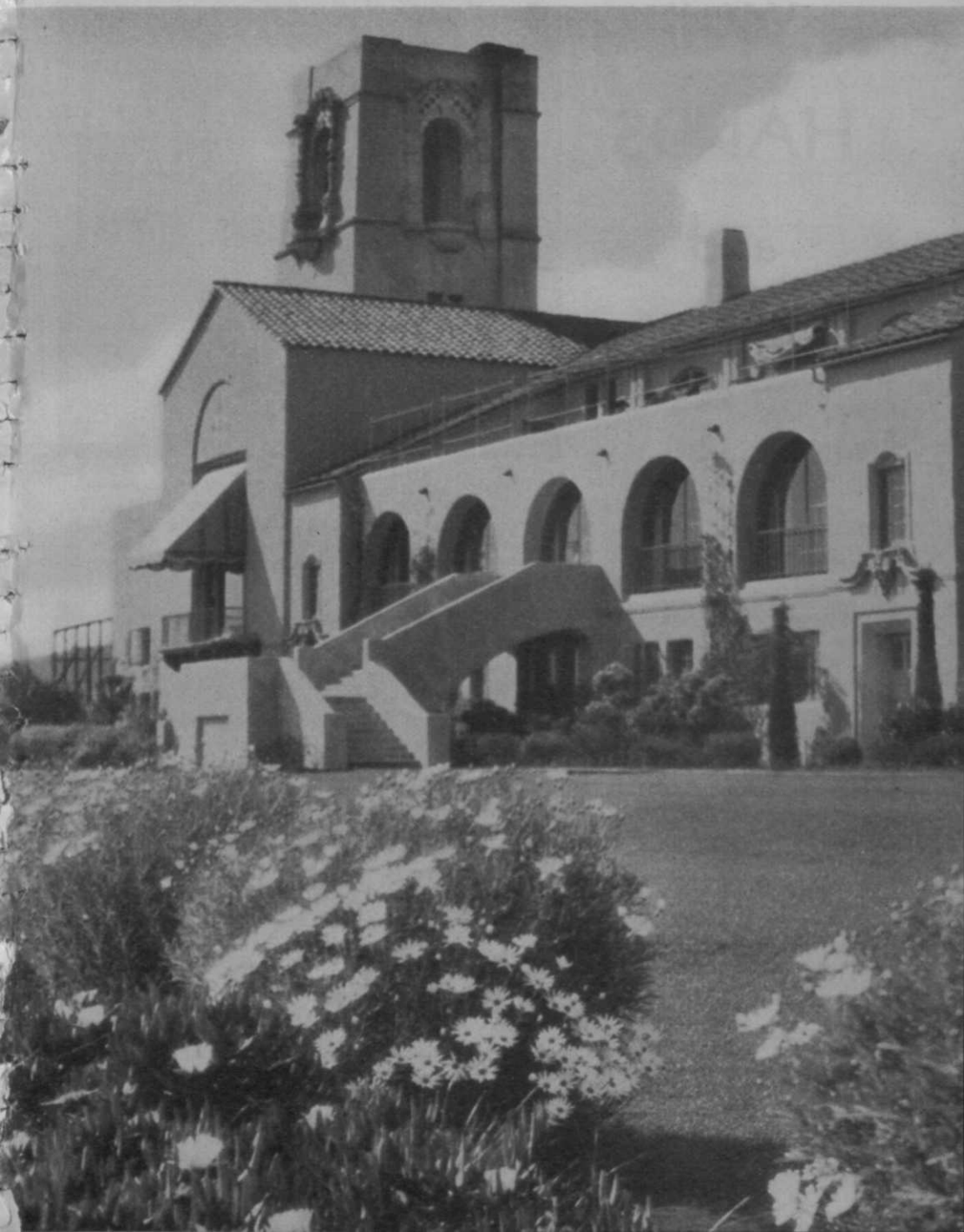
Photo: Clubhouse of the Montecito Country Club, Santa Barbara, Cal.