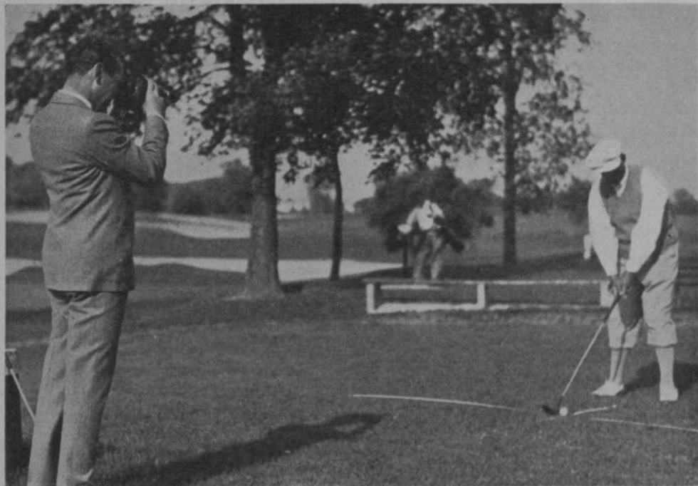
This photo shows how pupil is posed and how camera is held for best movie instruction results