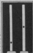
A steel ball dropped through a glass tube on this new head will rebound over 100% higher than on any wooden head.