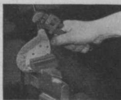
Its rigidly moulded-in steel shaft cannot be twisted or loosened even with a Stillson wrench.