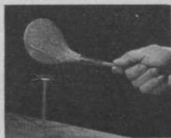
Driving spikes with this new golf club head will not chip, dent or break it.

SCHAVOLITE GOLF CORP. 22-19 41st Avenue, Long Island City, N. Y.