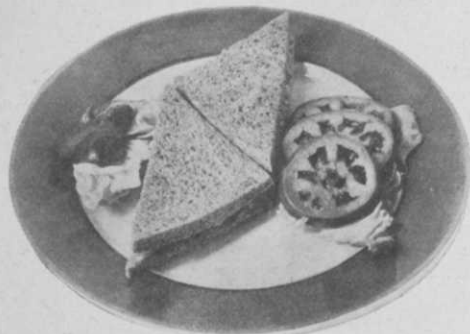
This sandwich Trianon is the old days' free lunch with a high hat. It makes the members customers for the house.

Anchovy paste, which comes in tubes, jars or bottles, may be utilized, or whole anchovies may be reduced to a smooth paste with a wooden spoon. Season with lemon-juice and spread the paste on the prepared pieces of bread. Split two anchovies lengthwise and lay them diagonally across