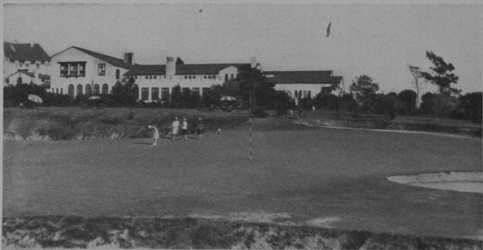
Wilshire C. C., where the 1931 Los Angeles Open will be played.