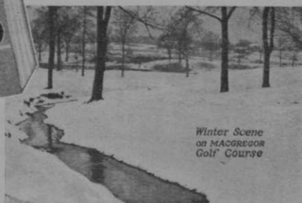
Winter Scene on MACGREGOR Golf Course

Until a few years ago it was considered that golf clubs were a commodity that could be sold only during, or just preceding, the golf season. Consequently, that was the only time they were sold.