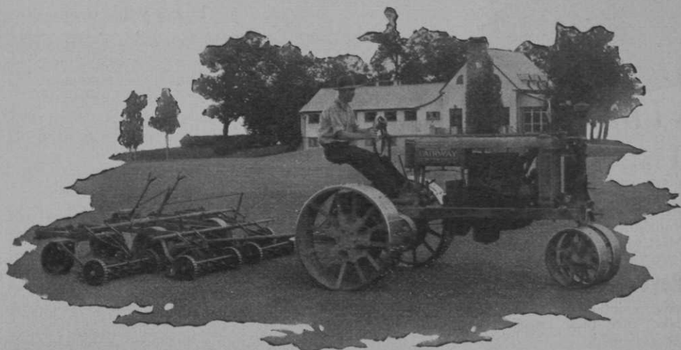
Fairway Tractor mowing fairways at the Coquillard Country Club, South Bend, Ind.

T HE McCormick-Deering FAIRWAY Tractor is a sound, practical investment in power for the special needs of golf courses, country clubs, estates, parks, and airports. It ably handles maintenance and construction work, applying its abundant power at drawbar, belt, and power take-off. It works as well on hills and rolling ground as on level stretches.