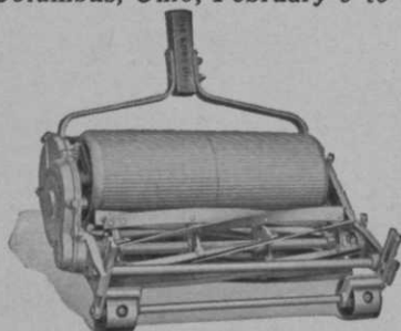
The light-weight, close-cutting PENN- SYLVANIA Super Roller Greens Mower.

We will exhibit at the Fifth Annual National Greenkeepers' Golf Show, Columbus, Ohio, February 3 to 6