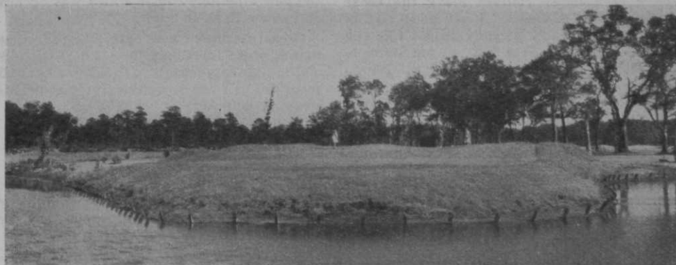
No. 5 at Sea Island is 135 yards long with water at the back and on both sides.

were obtained from farmers who were glad to get rid of them. All weeds were picked out before using. By this method you can get a green very quick as I have obtained a good putting surface in five weeks after planting stolons. The hotter the weather the quicker the results with the proper fertilizing which is best suited for the soil. Plenty of water is applied at night with the proper rolling and top-dressing. Some greenkeepers may say that this field Bermuda is too coarse for putting greens, but it is not.