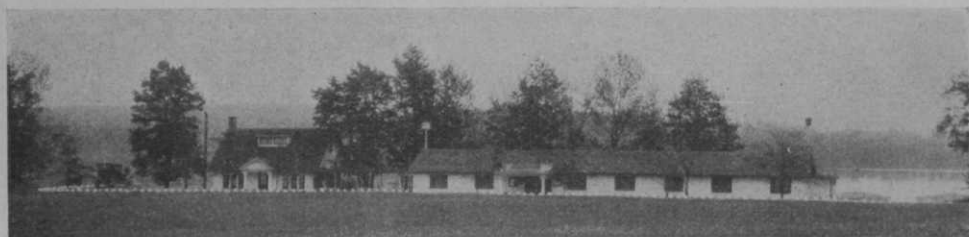
Hillsdale's inviting clubhouse has two "fronts," one of them facing Baw Beese Lake, the other the golf course.

to paint you a picture of what took place in the building of this fine little club. But few of the boys have enjoyed the relations I have and am still enjoying in my work with this fine bunch of members. Remember you at times have to forget your golf game; in fact there are so many things that take up your time the game I think of is the other fellow's.