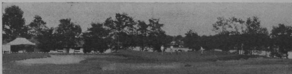
The No. 9 green at Hillsdale would do credit to many big-town clubs.