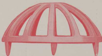
"CROWN" TEE MARKER

Staff is fitted with a plate which catches the ball as it drops in the hole. When staff is lifted ball comes out automatically. Attractively finished in Duco—in sets of nine or eighteen.