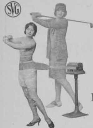
Model B Savage Health Motor — Popularly Priced