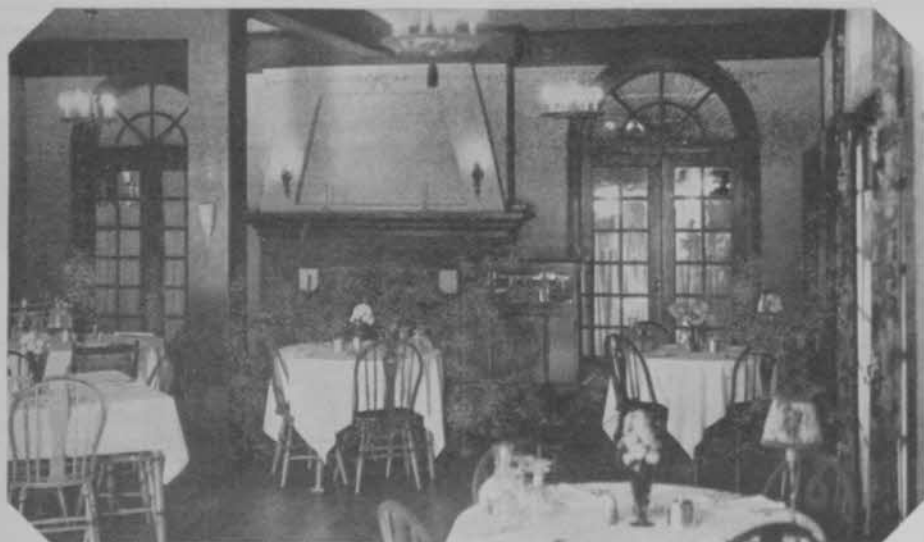
The Orchestrope at the Lake Tippecanoe C. C. fits into the dining-room nicely, and is moved into the lounge and onto the dance-floor when occasion requires.