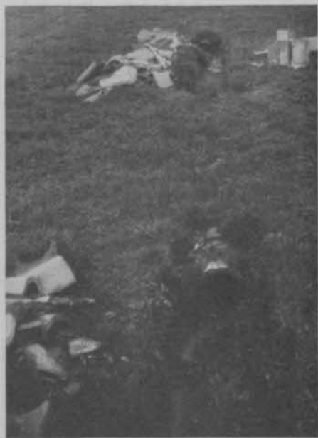
This trap drain lasted only a year. One winter of freezing and thawing wrecked it.

The other day a club member was bragging about the drainage of his course. "I can only remember," he said, "of one time that we had water on our fairways, and that was after a cloudburst about two years ago. No, sir, I don't believe there's