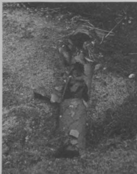
They put two drain-tiles, one inside the other, in this installation; but it didn't handle the strain.

drain up through the sand. The photograph shows what one winter of freezing and thawing has done to the tile itself.