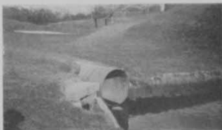
A brook at an inconvenient place was carried under a fairway into a lagoon.

Incorrect estimates on costs probably have a great deal to do with installation of drains, either the wrong type or under conditions where they cannot possibly stand up. For instance, in the case of the fairway drain shown in one photograph, three installations have been made in six years. Comparing the cost of pipe only, this rigid type installation might still show