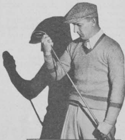
TEST THE TORSION

Grasp the grip tightly in the left hand and twist the club head with the right. Feel the slight torsion twist and immediate rebound in the Bristol Torsion Steel Shaft . . . The only steel shaft with full torsion. What a sweet feel! What endurance! Use them in both iron and wood clubs.