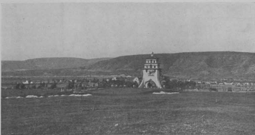
This is the ninth hole of Agua Caliente. It's a 200-yard par three, seen from the tee. Looks simple in the picture, but it's different with $10,000 first prize at stake.