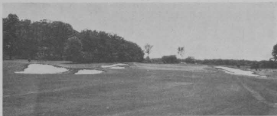
Greensmen will get many tips from the Lasker layout, one hole of which is pictured above.