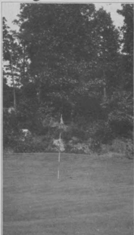
The 17th green, Brae Burn Country Club, West Newton, Mass. Du Bay fungicides have kept it free of brown patch.

For control, one pound of Semesan or Nu-Green to 50 gallons of water will treat 1000 square feet of turf by the sprinkling method. Applied by a power sprayer, 50 gallons of Semesan solution is sufficient for 2000 to 3000 square feet of turf; 50 gallons of Nu-Green solution for 1500 to 2000 square feet. Directions for use with each package of Semesan or Nu-Green. Buy now from your Seedsman or Golf Supply House.