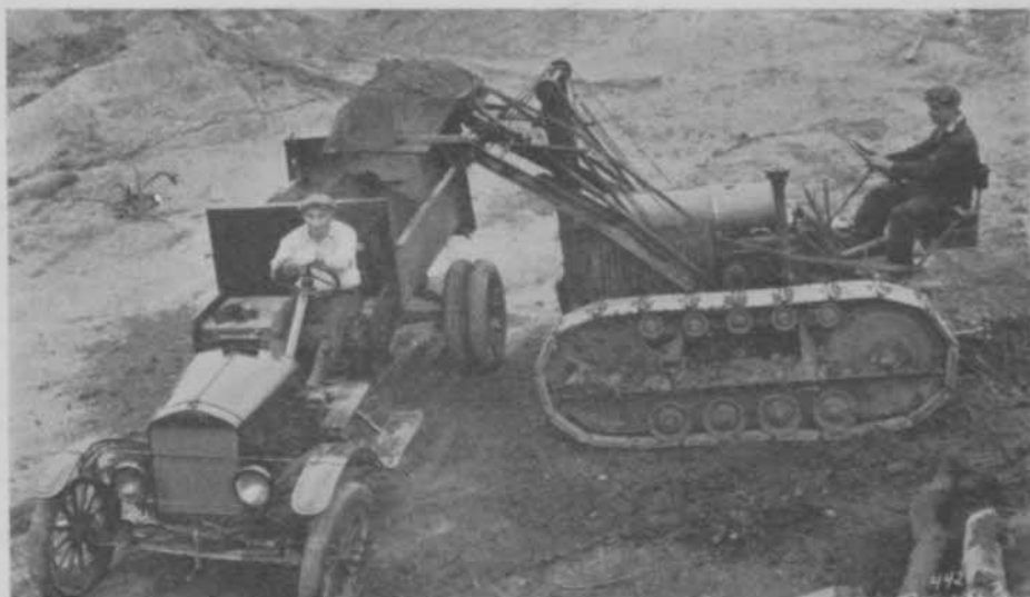
This tractor outfit with scoop and loader is kept busy all through the season, and then some, at Medinah in the Chicago district. It handles material for road and trap maintenance, compost, and is a money—and time—saver on construction jobs.

it to be a law that to boil an egg for that length of time will make it hard.