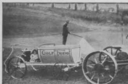
One of the smaller machines at work.