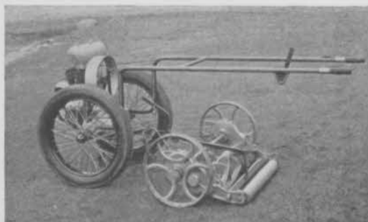
The Worthington "Overlawn"

The "Overlawn" is a power mower composed of a complete tractor drawing a Standard Worthington 30" fairway cutting unit. In this comparatively easy service it will last indefinitely.