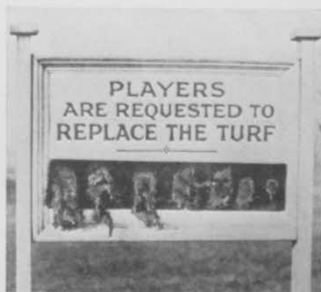
This display board at an English course shows some examples of unreplaced divots. It reduced a careless practice

move in this direction and thus gain credit from the members of the club for doing so. On the other hand, the greenkeeper who through one excuse or another fails to provide some method of cost-keeping, will have a very stormy path to travel at the end of every fiscal year of the club. Moreover, he will have no basis on which to calculate his budget for the succeeding year.