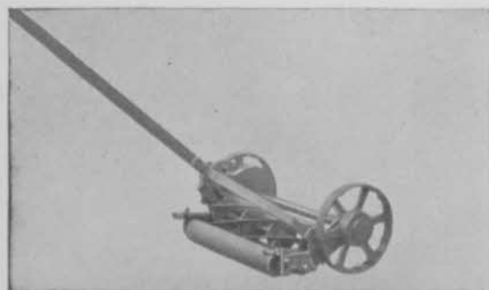
The "Shawnee" Putting Green Mower

The Shawnee 18-inch putting green hand mower is the peer of any hand mower in existence. Easiest to push and cuts a swath perfect in quality.