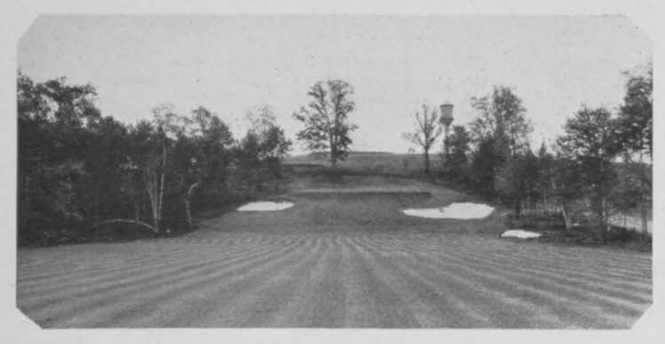
A vista at one of the newest and fine public courses, the Galloping Hill course, constructed and operated by the Union County Park commission, Elizabeth, N. J.