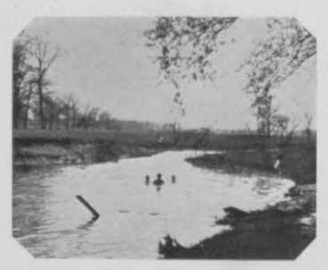
This is a part of a crowded golf course. Some of the unemployed caddles are making the most of its natural facilities. Before long the members probably will take a tip from the kids and get a swimming pool of their own by making use of the stream. The swimming pool is becoming recognized as a necessary detail of the well appointed golf club.

Ask yourself, "Does a $12 club in a dusty, untidy and carelessly kept shop look like it's worth $12 of any sane buyer's money?"