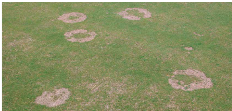
Fairy ring is shown on an ultradwarf bermudagrass putting green.

Most fungicide failures occur during the summer months when most