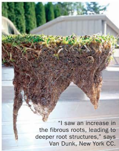
"I saw an increase in the fibrous roots, leading to deeper root structures," says Van Dunk, New York CC.

In the past, Kaufman and his staff have used a variety of fungicides with plant health benefits, as they have improved Prestwick CC's turfgrass appearance and vigor, despite variations in weather conditions. For example, in 2012, he began to apply Honor Intrinsic four days prior to his core aerification of greens, resulting in a near immediate healing of aerification