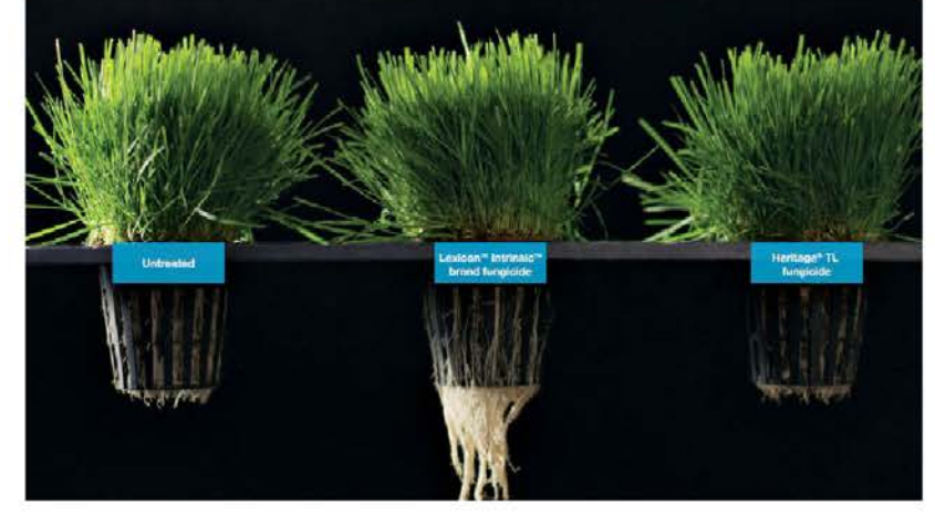
Root comparison between grass untreated, treated with Lexicon Intrinsic brand fungicide and a competitive azoxystrobin.

preventative and curative action on key turfgrass pathogens.