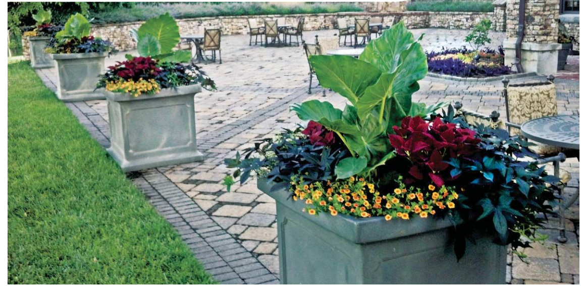
Continued from page 34

house on the whole. For example, fresh herbs and greens can easily be cultivated for the club restaurant. And flowers cut from the grounds can serve double duty as fresh bouquets for special events. Furthermore, a seasoned horticulturist can increase the sustainability of some maintenance operations by weighing in on costsaving landscaping decisions. Well-advised plant choices can save thousands in mulch and labor costs over just a few seasons.