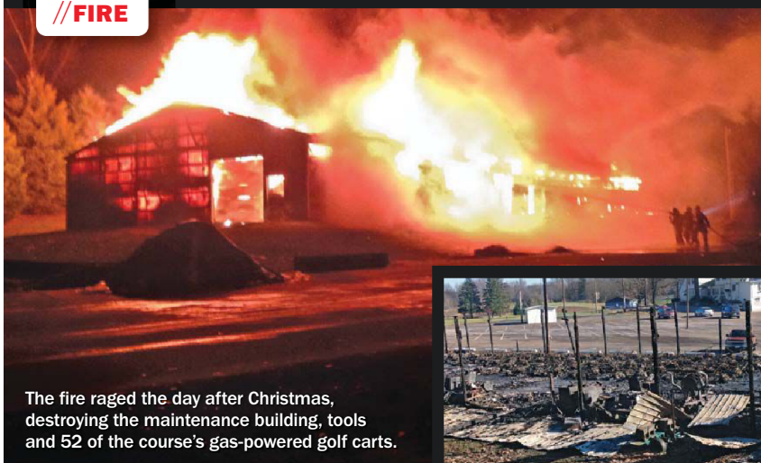
The fire raged the day after Christmas, destroying the maintenance building, tools and 52 of the course's gas-powered golf carts.