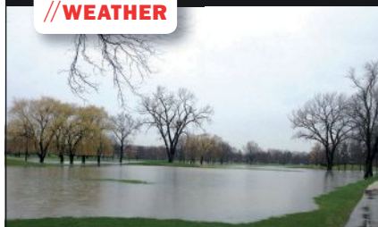
Standing water one day at Evanston GC, following 5.6 inches of rain in 24 hours...