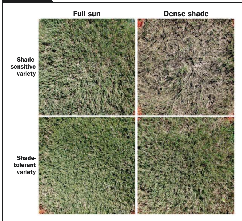
Buffalograss shade-tolerant and shade-sensitive experimental lines grown in full sun and under a shade cloth blocking 60% of the natural light (dense shade). The images were taken following three years of light treatments.

other turf species, buffalograss seeds, plugs and sod require more intensive management during the establishment period and can be significantly reduced once established.