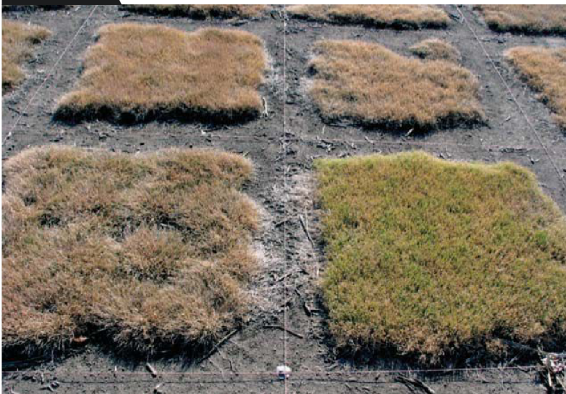
Buffalograss experimental lines growing near Mead, Neb., evaluated for late-fall color retention. This image was taken on October 29th, 2012.

“A common misconception of buffalograss is that it is a ‘no maintenance’ species. This concept often creates problems during establishment.”