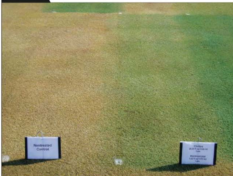
Civitas combined with Harmonizer, in addition to several other turf pigments and pigmented turf fungicides, applied in the fall can produce dramatically "greener" turf the following spring compared to non-treated turf. This photo was taken five months after the application on March 15th, 2012, in Madison, WI.