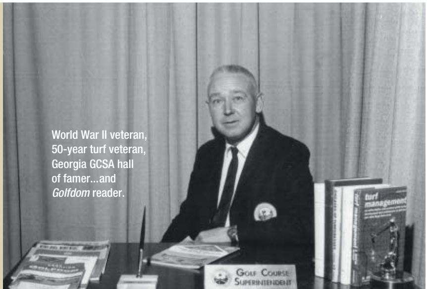
World War II veteran, 50-year turf veteran, Georgia GCSA hall of famer...and Golfdom reader.