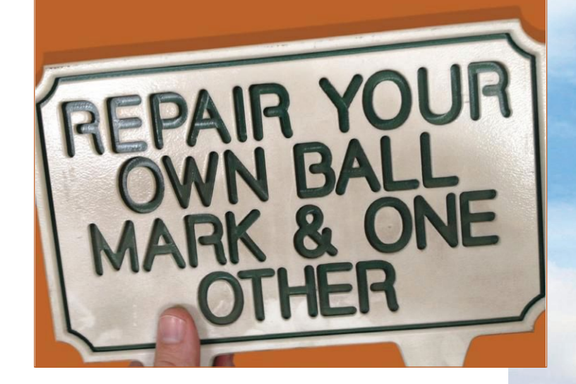
Continued on page 26

They also have this sign available, which we think should be mandatory at some of the courses we play.