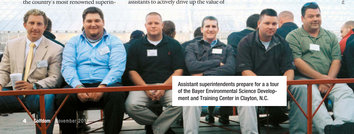
Assistant superintendents prepare for a tour of the Bayer Environmental Science Development and Training Center in Clayton, N.C.

What stood out most prominently about Green Start was the deeply rooted knowledge of all those who presented, and the passion and drive of 50 assistant superintendents determined to leave their mark on the field.