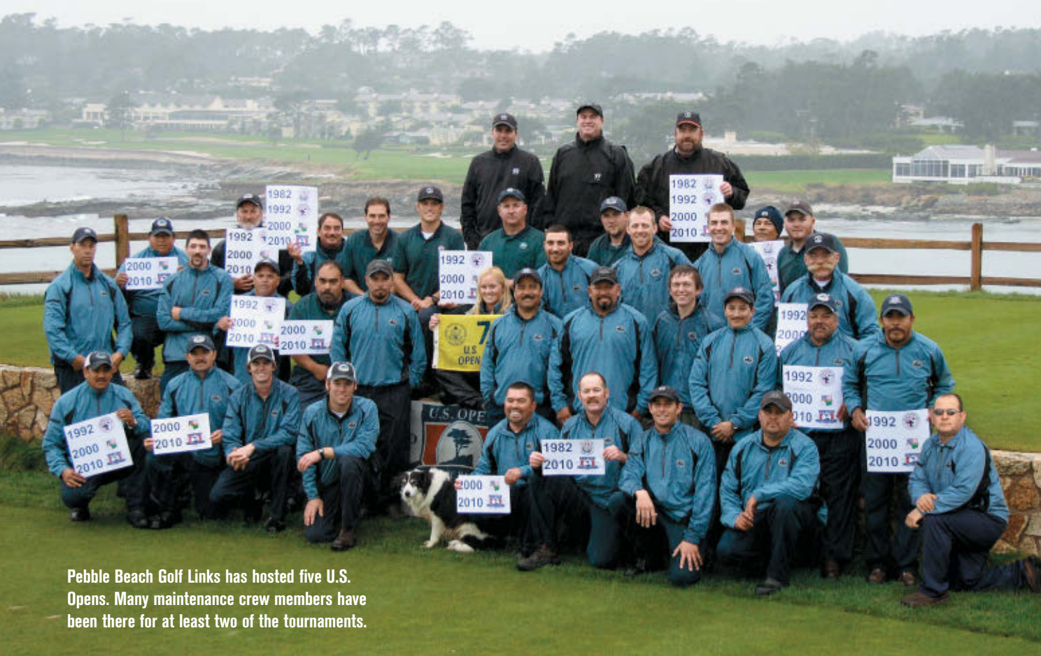
Pebble Beach Golf Links has hosted five U.S. Opens. Many maintenance crew members have been there for at least two of the tournaments.