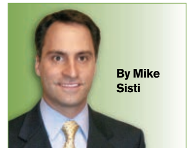
By Mike Sisti

The always-changing landscape of modern fertilization provides a rich subject for Golfdom's Fertility Report. Our company is pleased to help bring readers the insights of successful superintendents and landscape managers in the ongoing effort to answer not only the question of "What's working?" but also the logical follow-up query, "Why?" ■