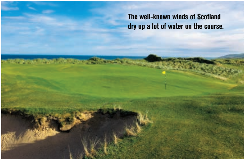
The well-known winds of Scotland dry up a lot of water on the course.