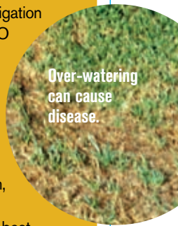
Over-watering can cause disease.