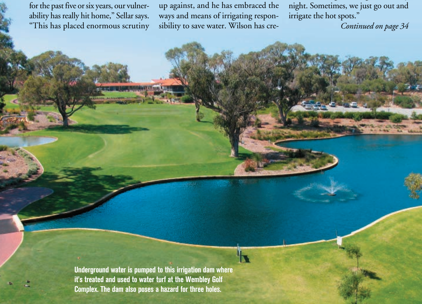
Underground water is pumped to this irrigation dam where it's treated and used to water turf at the Wembley Golf Complex. The dam also poses a hazard for three holes.