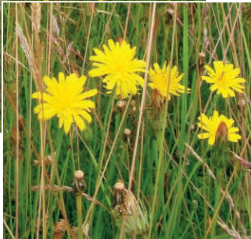
Up close and from a distance, the long-stemmed dandelions resemble wildflowers, not weeds.