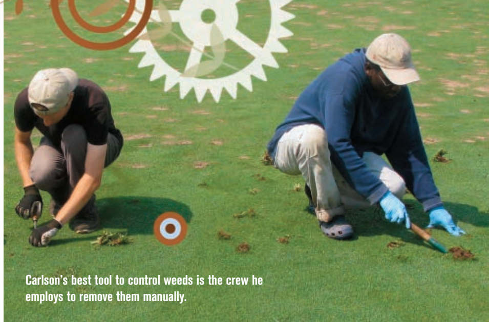
Carlson's best tool to control weeds is the crew he employs to remove them manually.

it's not the type of nitrogen source you use as much as it is how you use it," Carlson says.