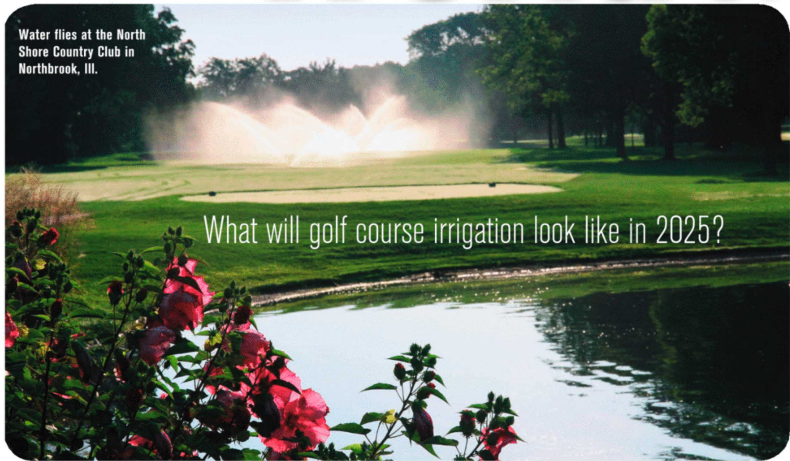
Water flies at the North Shore Country Club in Northbrook, Ill.

What will golf course irrigation look like in 2025?