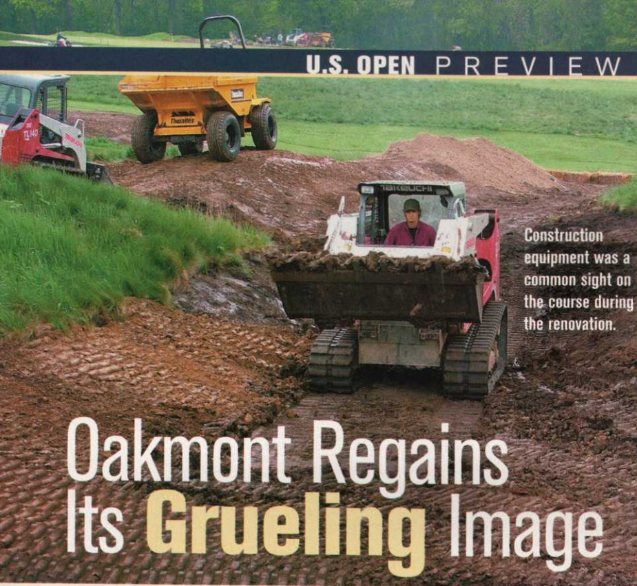
Construction equipment was a common sight on the course during the renovation.