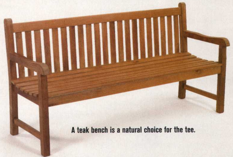
A teak bench is a natural choice for the tee.