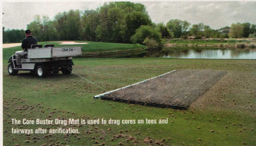
The Core Buster Drag Mat is used to drag cores on tees and fairways after aerification.