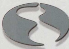
golf industry show