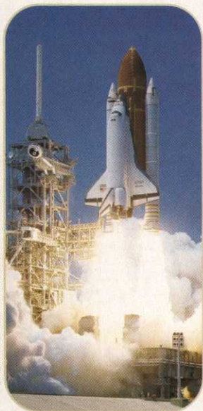
Kennedy Space Center Visitor Complex, NASA's headquarters, is located about 45 minutes from Orlando.

ORLANDO/ORANGE COUNTY CONVENTION & VISITORS BUREAU