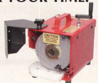
MAG-9000 Lawn Mower Blade Sharpener

Only Magna-Matic provides sharpeners with REAL performance (1 blade in 60 sec), and maintain perfect angles effortlessly. Take part in a 30 day trial now. Call for a free catalog.